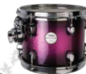
TH - ELECTRIC BERRY BURST

*New 22x20 configuration available January 2010