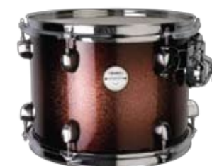
TX - ROOT BEER BURST