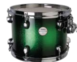
TG - ELECTRIC APPLE BURST