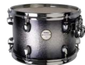
TJ - GALAXY BURST