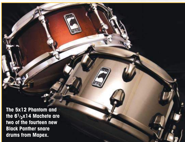
The 5x12 Phantom and the 6 1/2x14 Machete are two of the fourteen new Black Panther snare drums from Mapex.